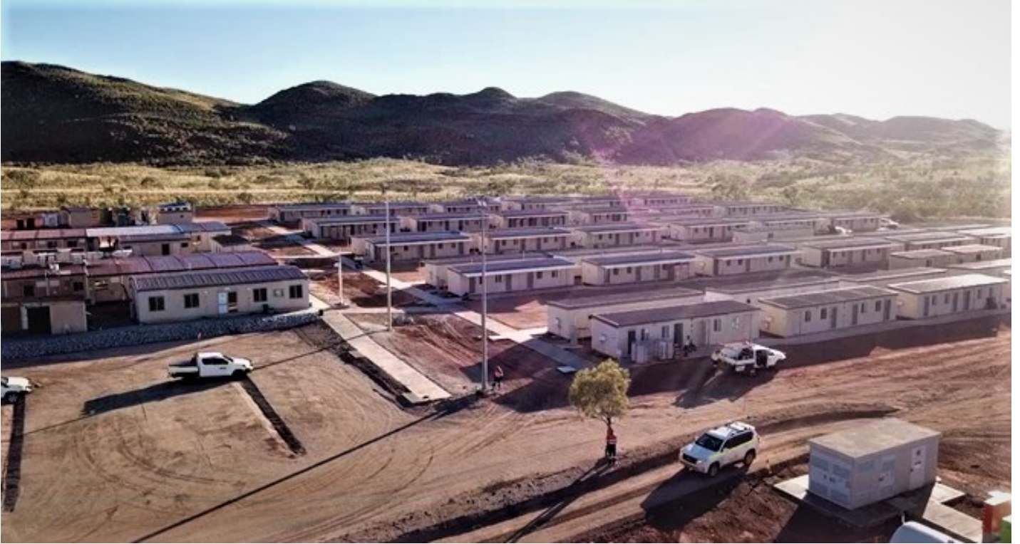
Figure 1: 240 room village at Warrawoona