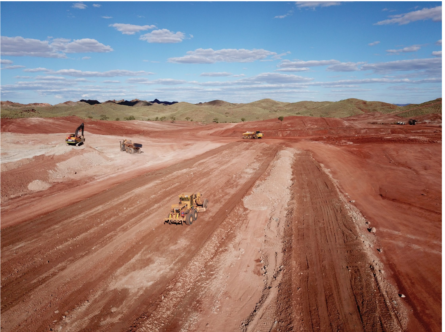
Figure 2: Bulk earthworks at process plant well underway